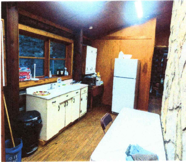
Kitchen with microwave